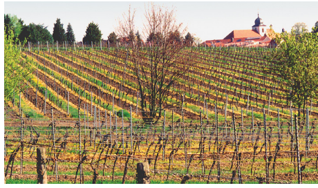
Wachenheimer Belz vineyard